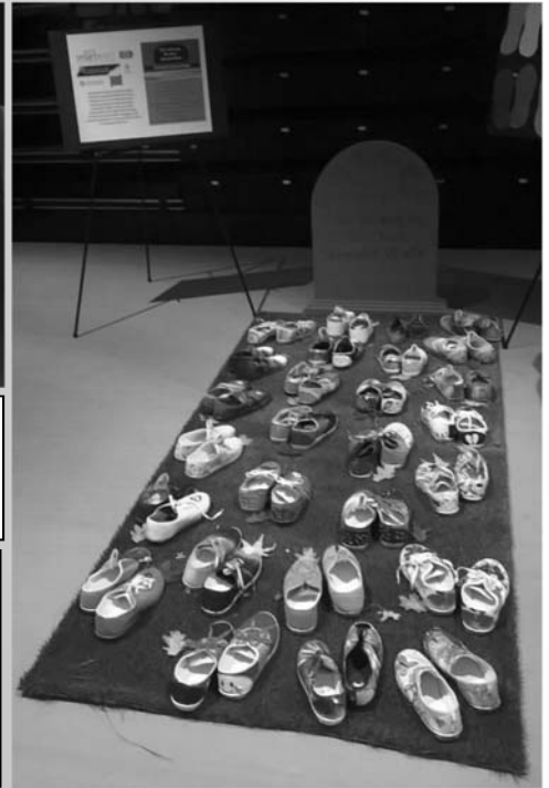
At right: "The Journey No One Should Walk" is the theme for this year's traveling art installation by Your Heart on Art, Inc., a Nashville-based non-profit devoted to the expression and release of emotional trauma through art. Each of the shoes featured in this display was decorated by a survivor of a suicide loss, an attempt, or ideation. This installation was displayed at events across Tennessee during the month of September.