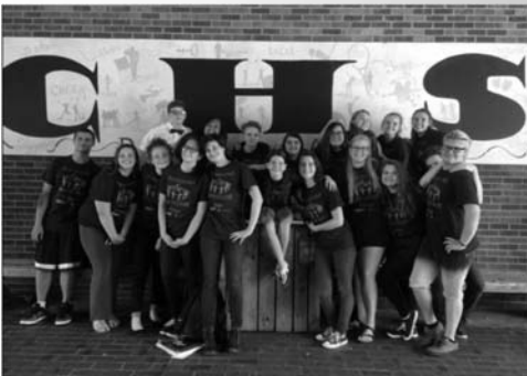
Students at Central High School in Knoxville participated in the "Stand Together for Suicide Prevention" social media campaign observed on September 16 across Tennessee's East Grand Region.