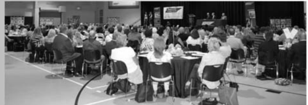
A photo of the crowd at the Suicide Prevention Awareness Day event, shortly after it started.

325 people attended this year's Suicide Prevention Awareness Day ceremony on September 14 at Trevecca Community Church in Nashville. This figure represents the largest number ever in attendance for this event, the annual highlight of TSPN's statewide Suicide Prevention Awareness Month campaign.