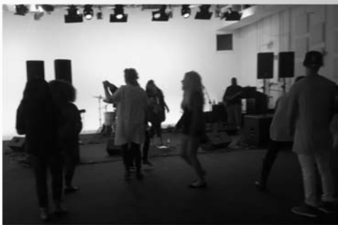
The #WeMatter Suicide Prevention Movement staged its Totally '80s Party on September 8 as a fundraiser for TSPN. About 100 people came out for 80s-themed musical performances and refreshments, and to share their stories of mental health recovery and wellness.