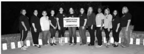
55 people turned out for Cowboy Up's "Light Up the Darkness" Suicide Awareness Walk on September 20 at the Riverwalk in Columbia. The event featured musical performances by Sean Gasaway and a candlelight vigil for those lost to suicide.