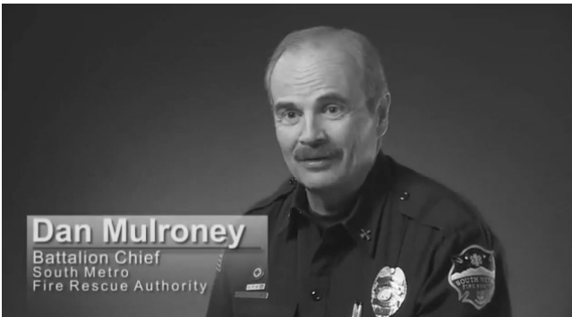
A still from "Firefighters Coping with the Aftermath of Suicide". Many of the firefighters participating in the video work out of South Metro Fire Station 34 in Lone Tree, Colorado, a Denver suburb.

The Carson J. Spencer Foundation, in partnership with the National Action Alliance for Suicide Prevention, and the American Association of Suicidology (AAS) has created a short film that discusses suicide risk among firefighters and available resources.