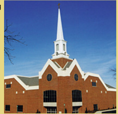
First Baptist Church Clarksville is hosting and co-sponsoring the new Survivor of Suicide Bereavement Support Group (Photo courtesy of the church website at www.fbct.org ).

A list of suicide survivor support groups supported and promoted by TSPN is available on the Network's website ( tspn.org/for-survivors-of-suicide ) along with information on support groups for survivors of suicide attempts ( tspn.org/for-survivors-of-suicide-attempts ).