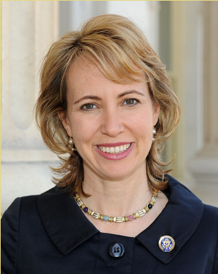
Giffords had previously co-chaired an event for NAMI in Arizona and is a longtime supporter of the group, according to a NAMI statement on released after the attack.

Mental health agencies across the country have been providing resources and commentary on the January 8 mass shooting in Tucson that left six dead and several critically injured, including U.S. Rep. Gabrielle Giffords.