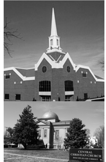
First Baptist Church Clarksville (above) and Central Christian Church in Murfreesboro are hosting and co-sponsoring new survivor support groups in the Mid-Cumberland Region.

A list of suicide survivor support groups supported and promoted by TSPN is available on the Network's website ( tspn.org/for-survivors-of-suicide ) along with information on support groups for survivors of suicide attempts ( tspn.org/for-survivors-of-suicide-attempts ).