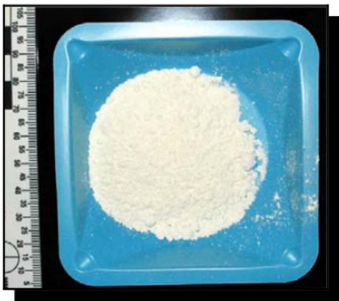
A sample of mephedrone confiscated during a drug raid in Oregon in 2009 (photo courtesy of the U.S. Department of Justice).

Street drugs marketed as "legal cocaine" or "legal speed" have recently been implicated in suicide crises and attempts in parts of the Southeast, including Tennessee.