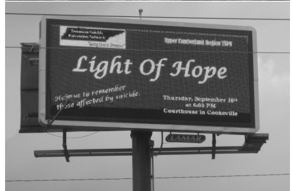
Above: the balloon release from last year's Memorial Walk in Kingsport. Below: Lamar Advertising donated the use of this digital billboard to promote last year's "Light of Hope" event in Cookeville.