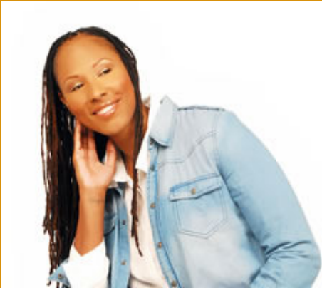
Chamique Holdsclaw is slated to speak during the luncheon segment of next year's Suicide Prevention Symposium.

TSPN is making plans for its Suicide Prevention Symposium, scheduled for 8:30 AM - 3:15 PM on Thursday, May 9, 2013, at Trevecca Community Church, located at 335 Murfreesboro Pike in Nashville.