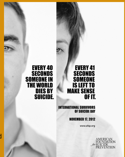
Promotional graphic for this year's event.

To organize a screening session in your community, refer to the AFSP's step-by-step online guide at www.afsp.org/survivorconference .