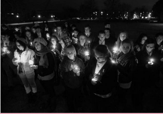
This photo from the “True Blue Candlelight Vigil” accompanied a November 8 Daily News–Journal article on the event.

The Alpha Tau Omega (ATO) chapter at Middle Tennessee State University joined forces with the campus chapter of To Write Love on Her Arms (TWLOHA) to stage the second annual True Blue Candlelight Vigil, a suicide prevention memorial and awareness event held November 7 on the MTSU campus.